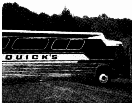
Bus No. 1 - Hung up

The driver did not take kindly to suggestions for solving the problem. In fact he