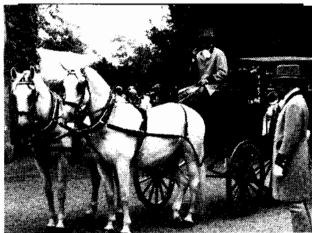
The couple leave by carriage

120 guests attended the wedding ceremony and the bride and bridegroom left for